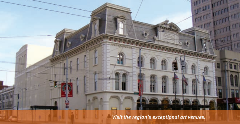
Visit the region's exceptional art venues.