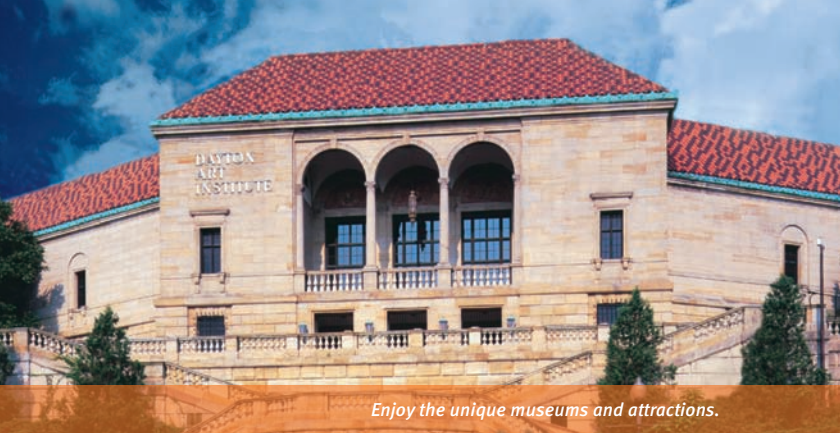
Enjoy the unique museums and attractions.